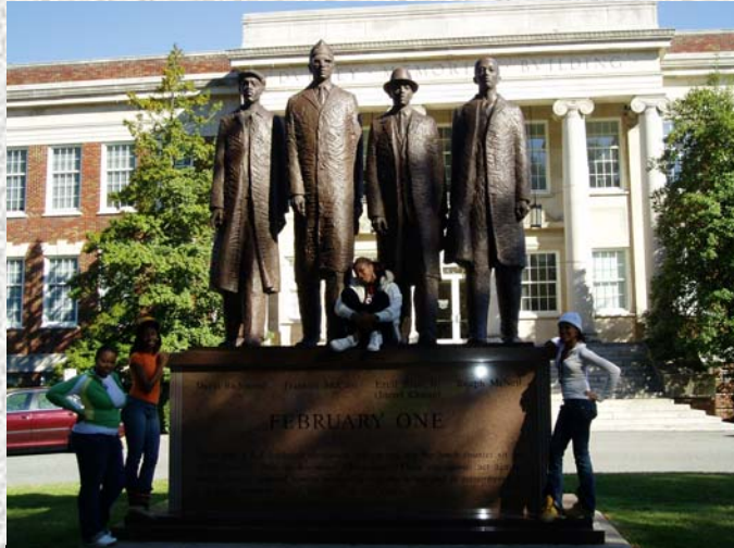
Students view the Greensboro Four memorial on the campus.

University Day is a day that A&T welcomes students to explore the campus, learn what possibilities are available if enrolled, and receive information on school programs, university infrastructure, and accomplishments of the school, students, and graduates. The day is filled with information fairs, campus tours, performances by student organizations, and a conference football game.